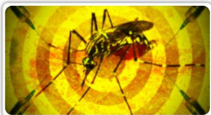
Outbreak of Yellow Fever in Brazil