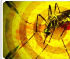
Outbreak of Yellow Fever