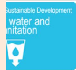
Sanitation on the the Sustainable