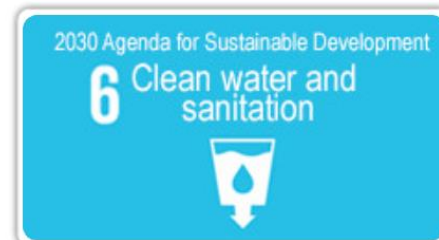
Safe Water and Sanitation on the Agenda 2030 for the Sustainable Development